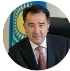
BAKYTZHAN SAGINTAYEV Prime-Minister of the Republic of Kazakhstan