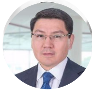
ASKAR ZHUMAGALIYEV Deputy Prime-Minister of the Republic of Kazakhstan