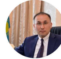
DAUREN ABAYEV Minister of Information and Communications of the Republic of Kazakhstan