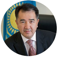
BAKYTZHAN SAGINTAYEV Prime-Minister of the Republic of Kazakhstan