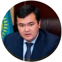
ZHENIS KASSYMBEK Minister for Investment and Development of the Republic of Kazakhstan